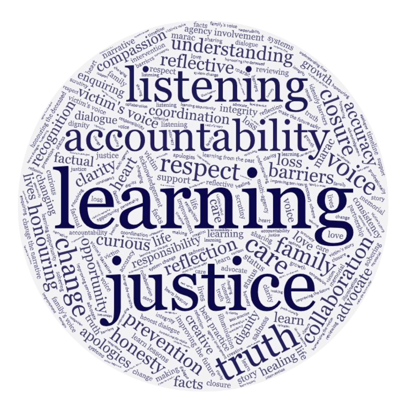
Figure 2: "What do DHRs mean to you?", word cloud generated from DHR Network pre-launch attendees. (n=65)

AAFDA has a wide-ranging training and professional development offer, for professionals across several agencies and sectors. Given the importance of DHRs in driving improvement in domestic abuse services, a primary focus for AAFDA is the professional development of DHR Chairs and processes through the DHR Network and accredited training.